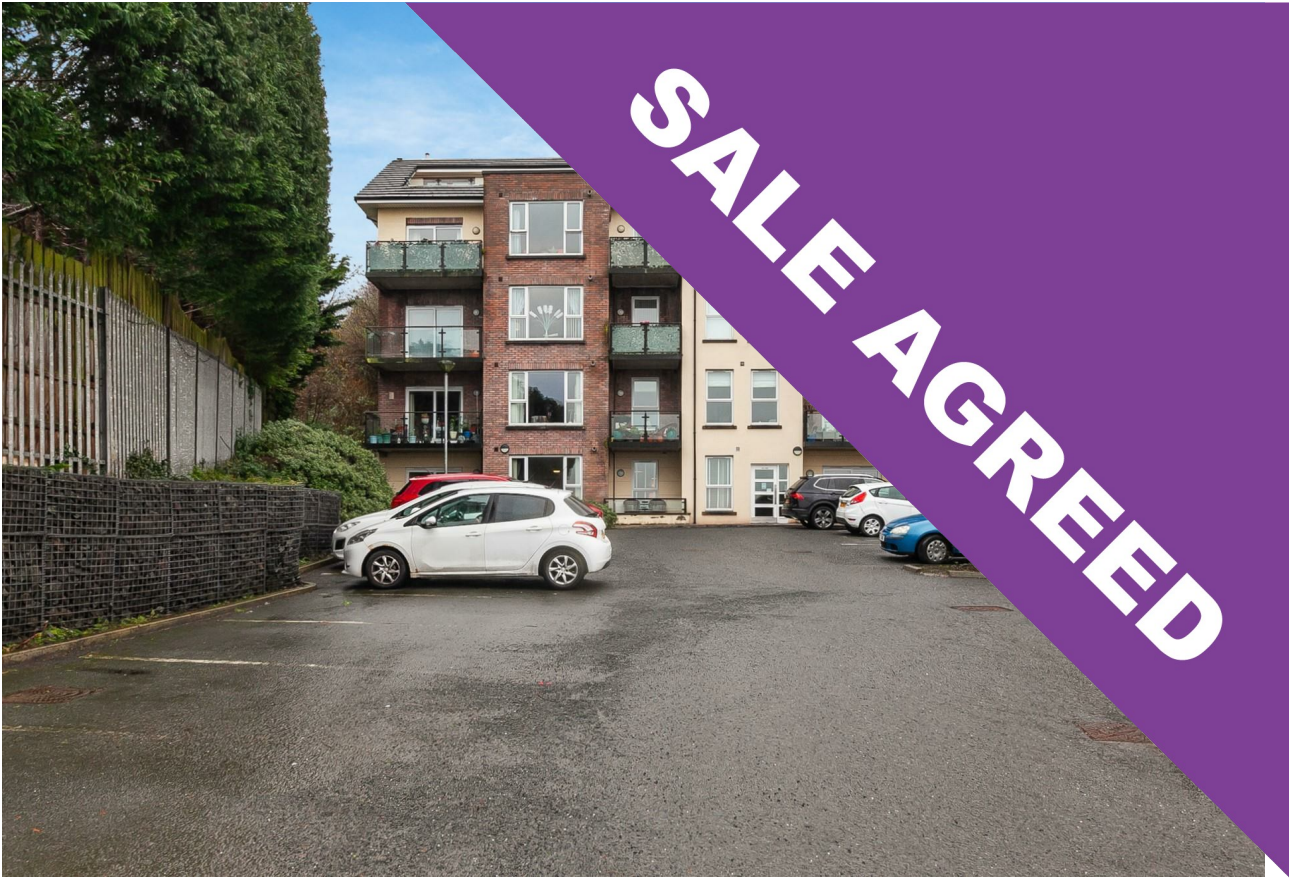
Apartment 93, 8 Northview, Newtownabbey, BT36 7GA